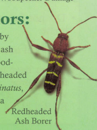
Redheaded Ash Borer

Ash may also be stressed by drought, diseases such as ash yellows, and by native wood-boring insects like the redheaded ash borer, Neoclytus acuminatus , (Fabricius) which creates a round emergence hole.