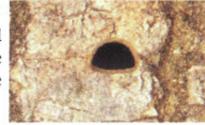
D-Shaped Emergence Hole