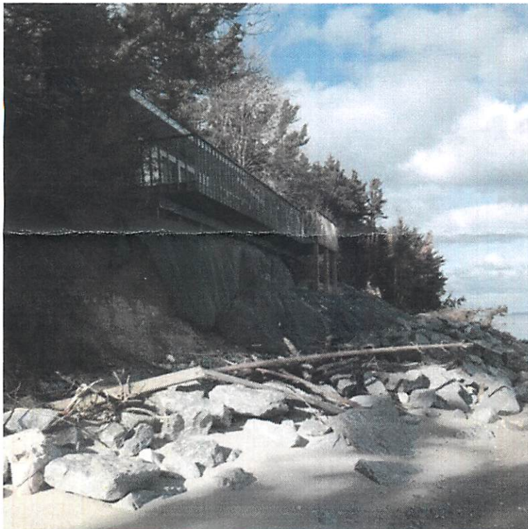
31250 East Side Drive