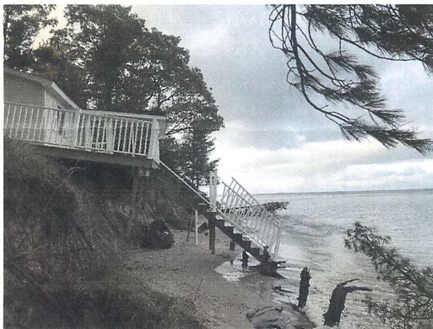
East Side Drive