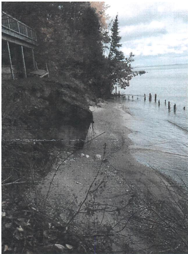
30930 East Side Drive